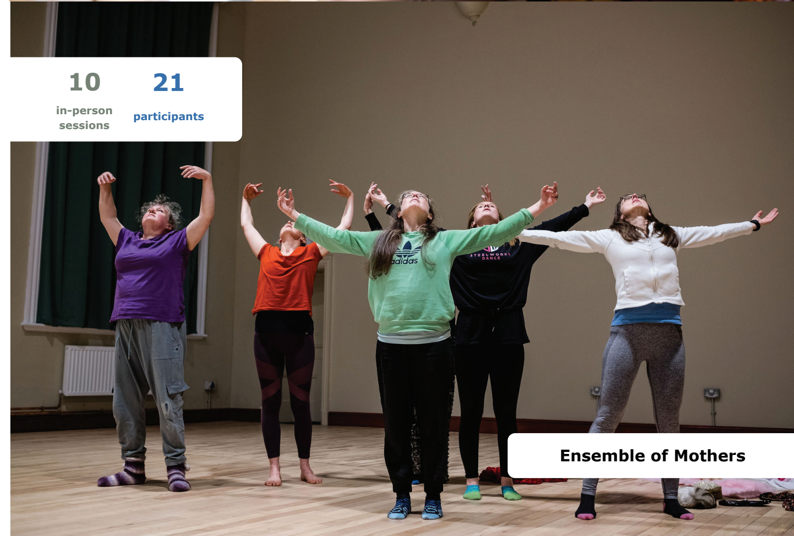
Ensemble of Mothers