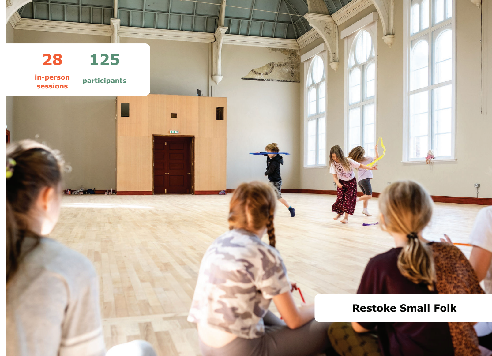
Restoke Small Folk

Thanks to funding from This Girl Can (Sport England) we will be continuing to offer dance workshops for mothers throughout 2022.